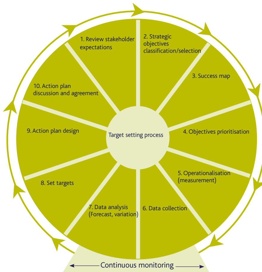
Figure 2. The target setting wheel